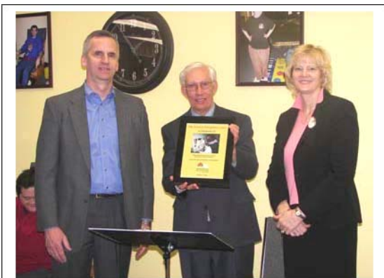
The ServiceSource Foundation funded a state-of-the-art Sensory Perception Center at the Woodmont CIC in FY 08.

Established in 1971, ServiceSource is a regional not-for-profit 501 (c)(3) that provides employment and training services for people with disabilities. ServiceSource has operations in Virginia, Maryland, North Carolina, South Carolina, Colorado and the District of Columbia. ServiceSource is a nationally recognized leader within the disability field, providing quality jobs and support services to people with disabilities.